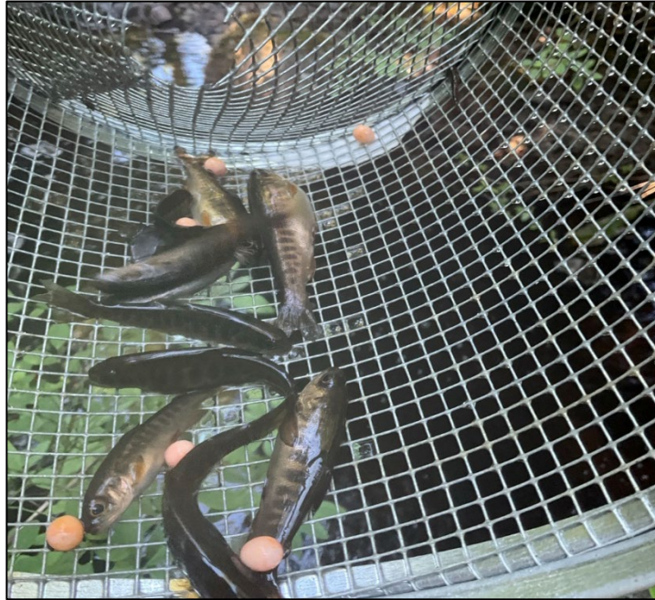
Figure 1.—Juvenile coho salmon and Dolly Varden caught at waypoint 1008.