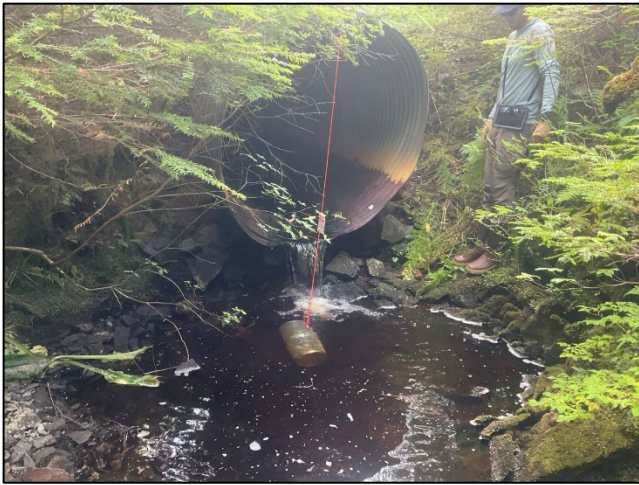
Figure 2.—Channel flowing through perched culvert at 1008.