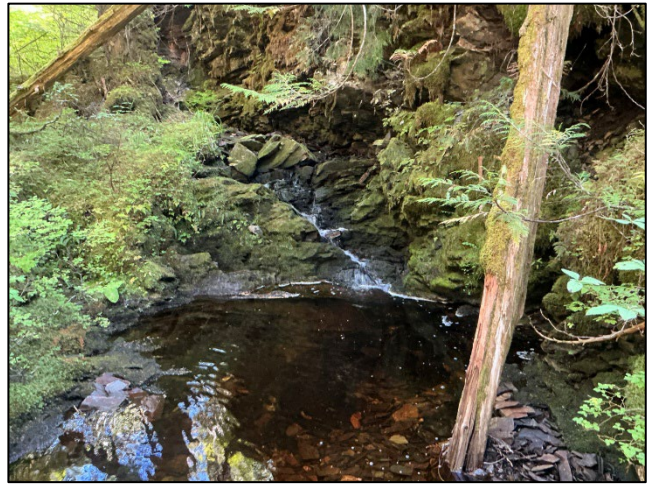
Figure 3.—Bedrock cascade at waypoint 1031.